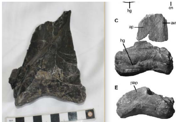
Fig. S2. Right astragalus of Fukuiraptor and left astragalus of NMV P150070 in posterior view showing accessory posterolateral ascending process (plap – arrow).

We note that the autapomorphy of Tachiraptor “the caudolateral corner of the fibular condyle forms a sharp angle in proximal view and extends slightly more caudally than the medial condyle” in Langer et al. (2014) is also present in a small abelisauroid from Tanzania (MB.R.1751; Rauhut 2005; pers. obs.).